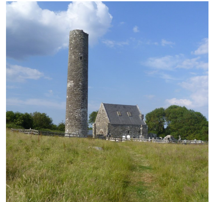
Inis Cealtra, Lough Derg