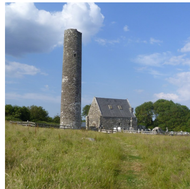
Inis Cealtra, Lough Derg