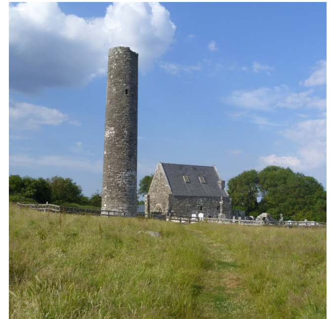
Inis Cealtra, Lough Derg