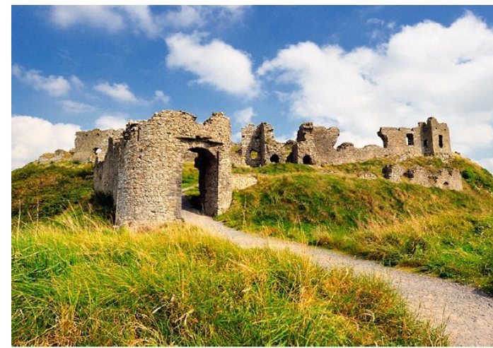
Dunamase Castle, Co Laois