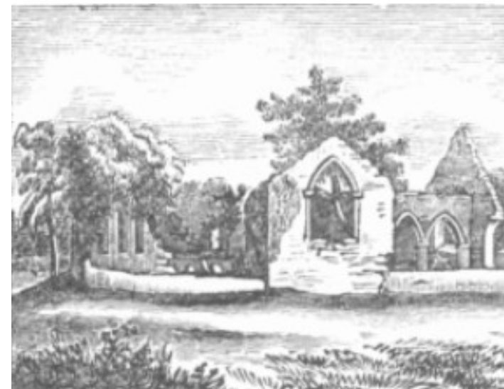
Roscommon Abbey, Dublin Penny Journal 1836