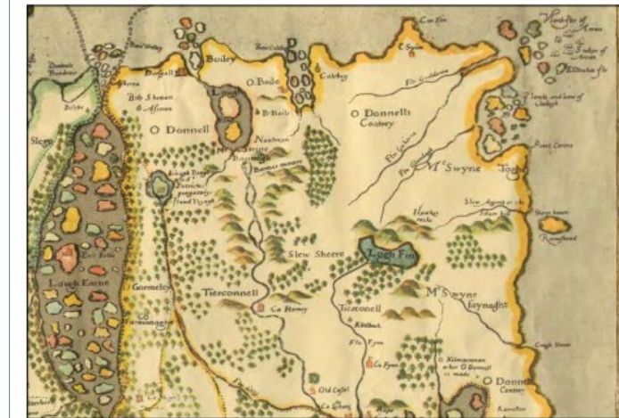
From Map of Ireland by Baptista Boazio, 1599

Historic Settlement: Atlantic South Donegal