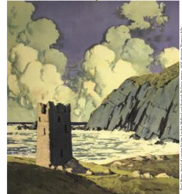
Paul Henry, detail of a poster for the London Midland and Scottish Railway agency, 1936, showing Hussey's folly.

Landscape and historic settlement in Corca Dhuibhne