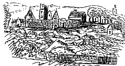
Ruins of the Abbey of Clare. Clare. { S. Castle. G. Abbey.

Membership of the Group for the Study of Irish Historic Settlement (annual Subscription €10, students €5) is open to all who share an interest in settlement history and the making of the Irish landscape.