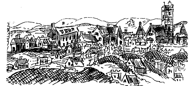
A. The Abby Church. D. The Hall of the Azyzes. B. Lenthalls the Chief Inn.